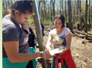
High school students at Evergreen as part of our Earth Science and Biology field trips.