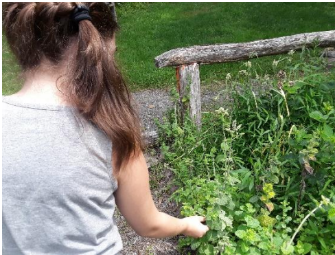
Exploring EHC Gardens