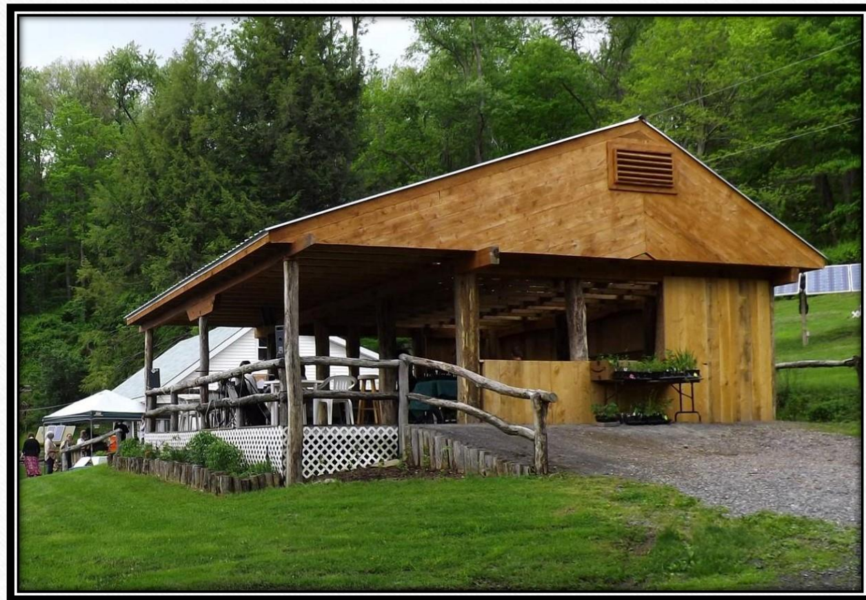
Covered Gateway Pavilion