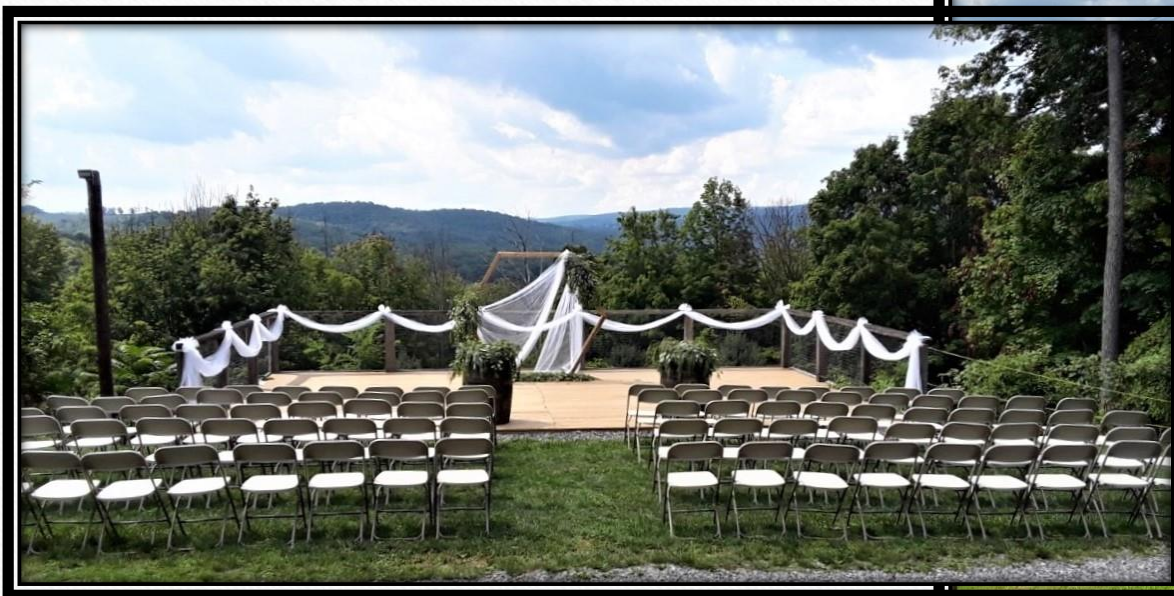
View of Barn & Deck Overlook