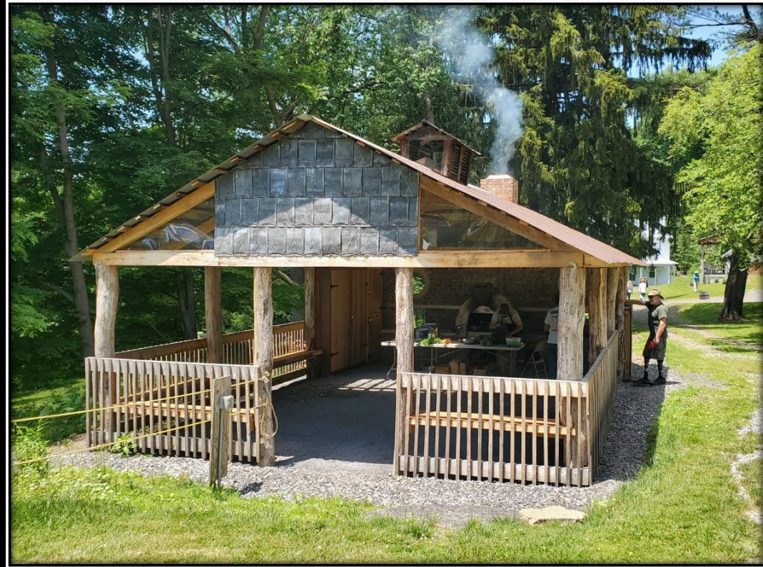
Outdoor Kitchen Pavilion: includes refrigerator, brick pizza oven, 4 burner cooktop, and flat cooktop. Bench seating lines perimeter – tables available.