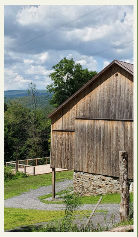
Education, Conservation, Preservation